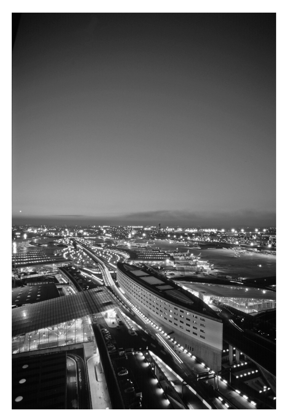
[12.5] Roissy 2, 2003.