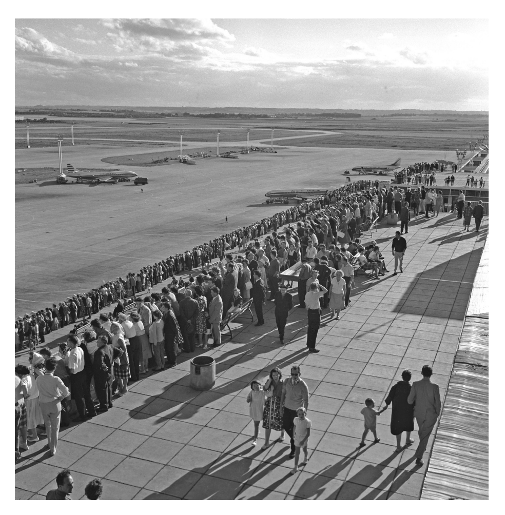
[12.4] Orly Airport, observation terraces, early 1960s.

very first aeronautical shows – became enhanced by the airport experience. The great airports that had been built in the 1930s proffered the choreography of planes moving on the ground. Le Bourget, LaGuardia, Tempelhof – all of them designed or considerably renovated before World War II and the rapid expansion of commercial aviation – were fitted with observation decks that recalled the pageantry of the epic air rallies. Here, the parallel with the imaginary seemed tangible. The airport viewing platform was a legacy both of the public rally stands from which the spectacle on the ground was surveyed and of fantastic high-level balconies from which the city could be seen from above.