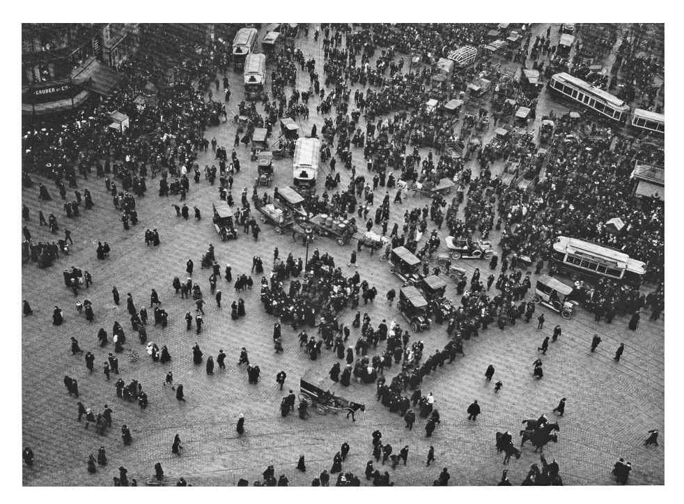
[12.1] Léon Gimpel, 'The Parisian Crowd in the Place de la Bastille', 27 February 1913.

friends, but – inspired by the new times, those of a spatial revolution that celebrated vertigo and instability – had aimed at a reconfiguration of reality.