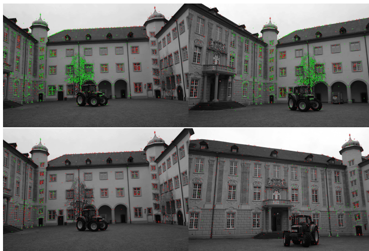
Fig. 2. Pairs (0,1) on top and (0,4) on bottom of the used Strecha’s Castle-P19 sequence. For visualization purposes, the data matches were classified as inliers (green) and outliers (red) using an arbitrary threshold of 3 pixels on groundtruth errors.

Evaluation errors (see Section 4) are shown in the last 4 columns of Table 2. Pair (0,5) is not reasonably solved on average by any of the methods, although occasionally all of them found a good solution. We highlight in bold the best results among the three non-parametric methods (ORSA, Hiso, Hani) excluding RANSAC, but at the same time we keep the RANSAC output in the table for the reader to see the sometimes dramatic effect of parameter selection. According to our preliminary experiments, ORSA gives slightly better average results than our proposals for medium-to-high inlier ratios, being worst on average otherwise, depending on the feature distribution – see for instance results on pair (0,4).